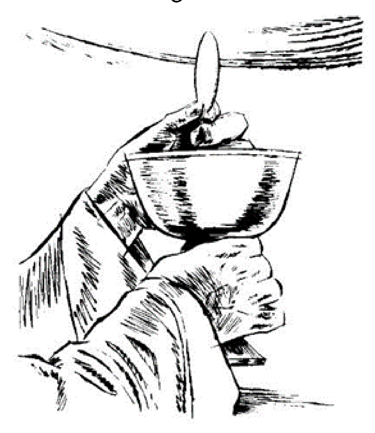
The Third Sunday after Trinity 25<sup>th</sup> June 2023, 10.15 a.m.