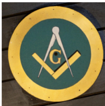
The Square and Compasses: symbols of Freemasonry