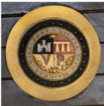
The Mayor of Pontefract's Seal 1638

A photograph of each individual boss will be on display in the café area for one week from Sunday, 18 th September to enable you all to have a close up view.