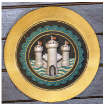
The Ancient Borough Arms