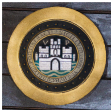
A Siege Coin