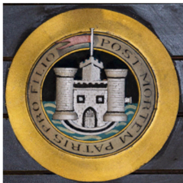
The Corporation Seal